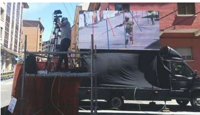
Big Screen and Camera