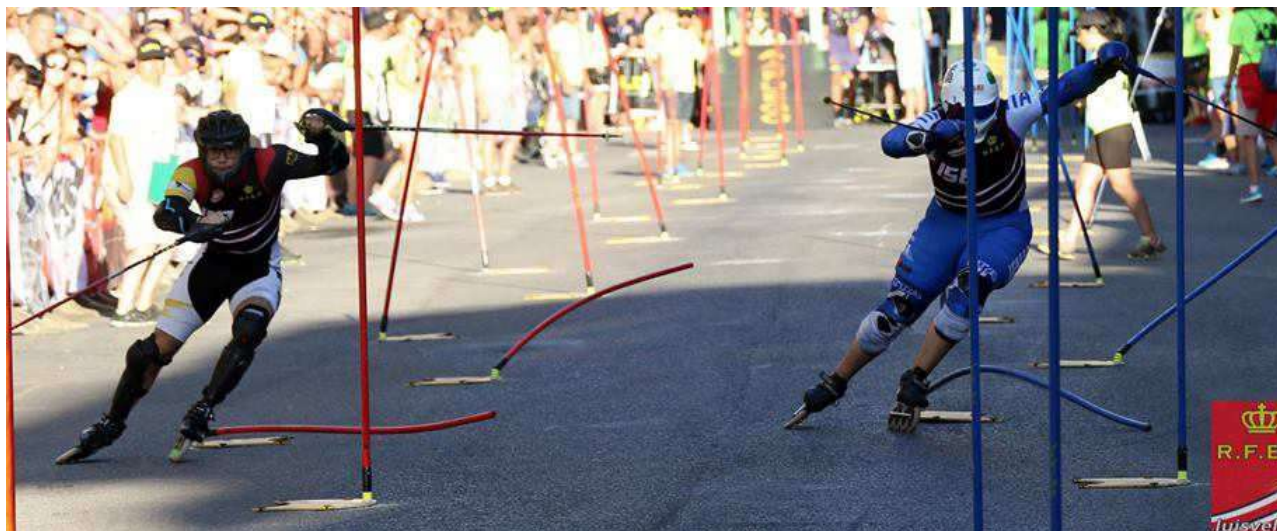
Parallel Slalom 2017

In 2015, this town organized, with great success, one race of the Inline Alpine World Cup; in 2016, the Giant & Team Race World Championships and, also, the World Cup Final and Parallel Slalom; and, in 2017, it will host European Championships and, also, one race of the World Cup.